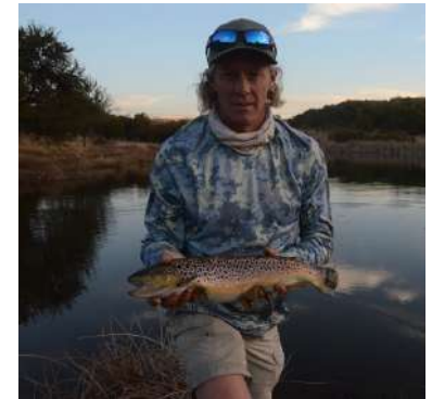
Tiger fishing in Mozambique (left) and Trout fishing on Iwamanzi (right)