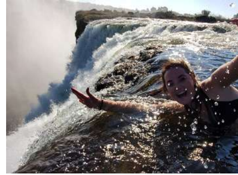
Victoria Falls (above)

Let us put our years of guiding experience into designing a bespoke adventure for you. From stunning Cape Town, to the mighty Victoria falls. From Tiger fishing in Mozambique to meandering around the Okavango in Botswana with the elephants, Africa has something for everyone.